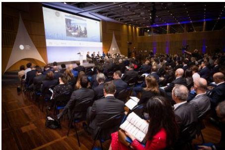
The French Ministry for the Economy and Finance in Paris