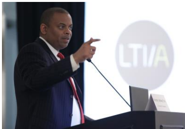
U.S. Transportation Secretary Anthony Foxx addresses the meeting